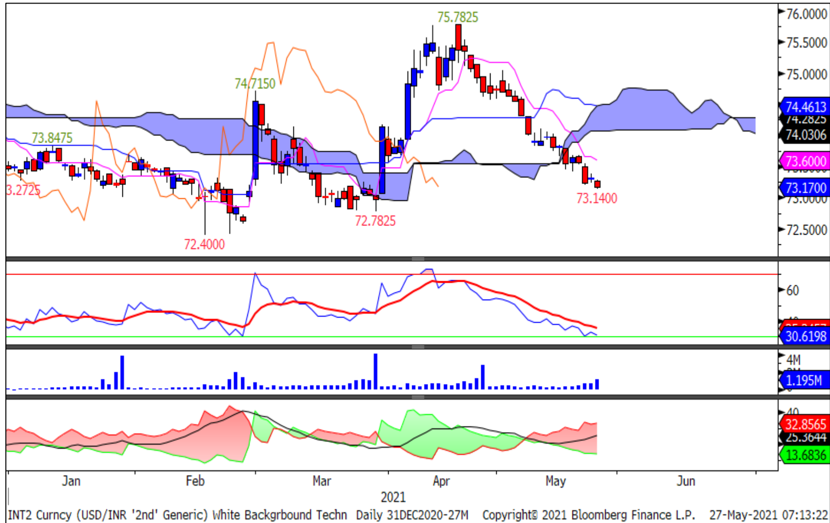
USDINR June Daily Chart